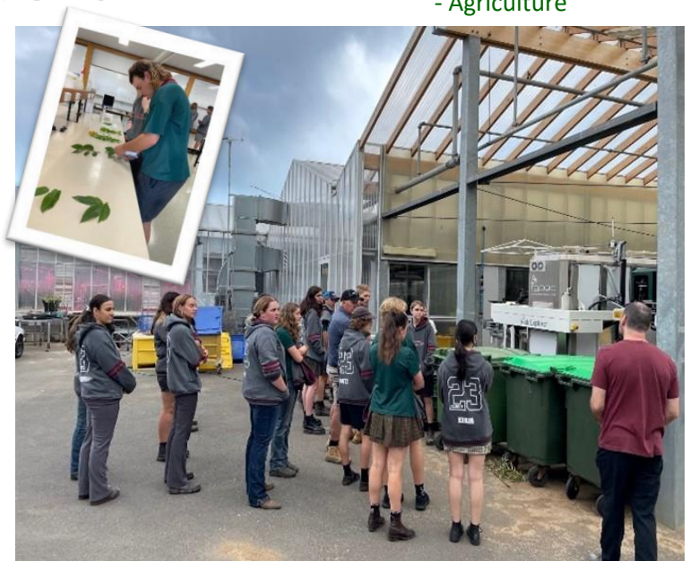
HIGH TECH - Year 12 students visit the Plant Accelerator, Waite Campus. Inset: TESTING TIMES – students undertake lab testing at Waite Campus.