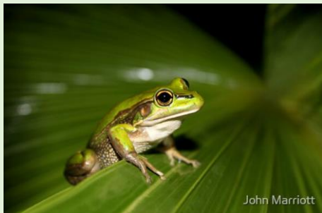
Figure 1: A bell frog showing green colouring due to environment and genetics.

Aquaculture Club students do a brilliant job managing the Southern Purple Spotted Gudgeon breeding program in the aquaculture shed and ponds. This successful project has been running for many years now, with thousands of fish bred and released as a result. Considering the overwhelming success of this program, with breeding Gudgeons even in our wetlands now, it is time for students take on another species!