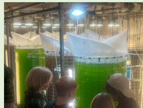
Figure 3: Algae growth systems

work regrowing seagrass meadows along our coast. Students learned how seagrass meadows function as vital fish nurseries, and how these carbon sinks have been waning, releasing their stored carbon, sequestering less, and reducing habitat for other species.