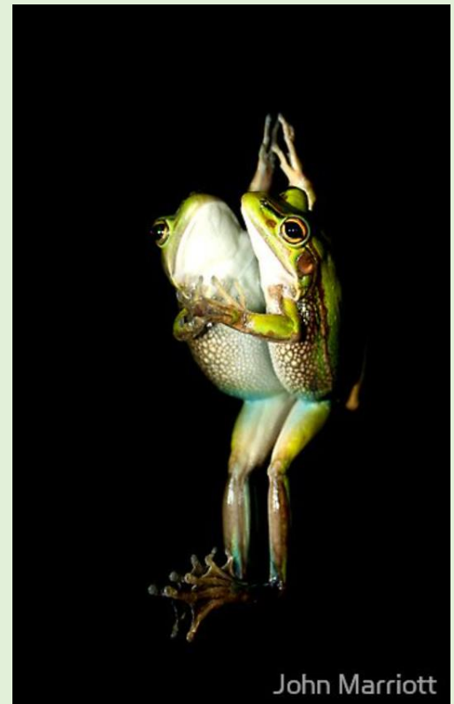
Figure 2: Bell frog reflection showing underside and inner thigh colouring.

This project will continue to run each year and be available for Aquaculture students to use in their class projects, and once frogs are mature, provide opportunities for excursions doing releases to locations such as Goolwa. These conservation projects provide a great opportunity for students to look in the mirror and reflect on their own impact, considering how we can further reduce damage to the environment that our frogs, and all of us rely on.