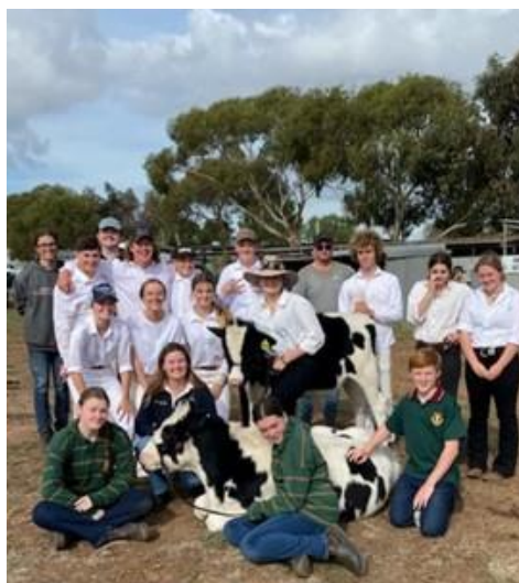
A Dairy Good Time: Urrbrae Dairy Club students at Murray Bridge.

It was a fantastic show and it was awesome to see students be so supported throughout. Well done to all involved.