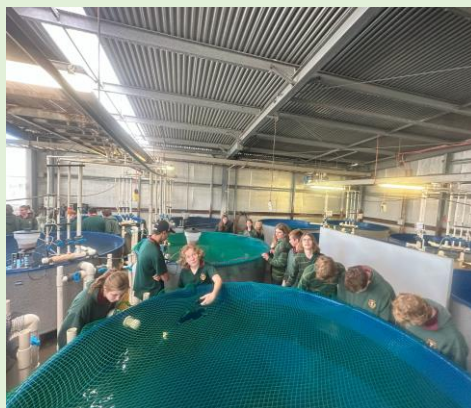
Figure 2: Students observing SARDI tanks

to this is vital to protect the oyster industry in South Australia. Students learned how oysters feed, and the huge volume of algae needed to produce even a small number of oysters. This was a great learning opportunity, as visually seeing the massive amount of plant material needed to grow a small volume of animals was a great insight into food webs and trophic levels, linking back to their biology course. This then is multiplied again if thinking of the volume of material needed to grow live fish to feed even a small number of bigger fish.