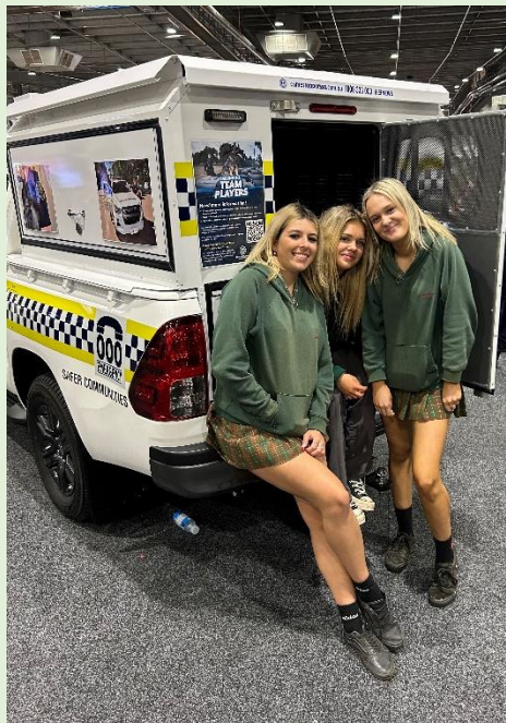
SAPOL Career Expo: Students at the SAPOL stand at the Career Expo.

We have also had some exciting excursions and guest speakers related to career development. On May 12, we took all our Year 10 students, as well as some Year 11 and Year 12s to the Career Expo at the Wayville Showgrounds.