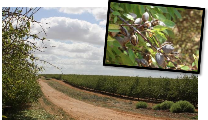
Almonds Galore: Rows of Almond trees and (inset) mature almonds ready for picking.