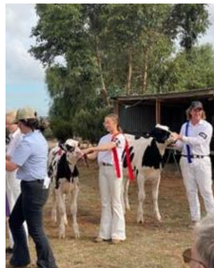
Standing Tall: Showing dairy cattle at Murray Bridge