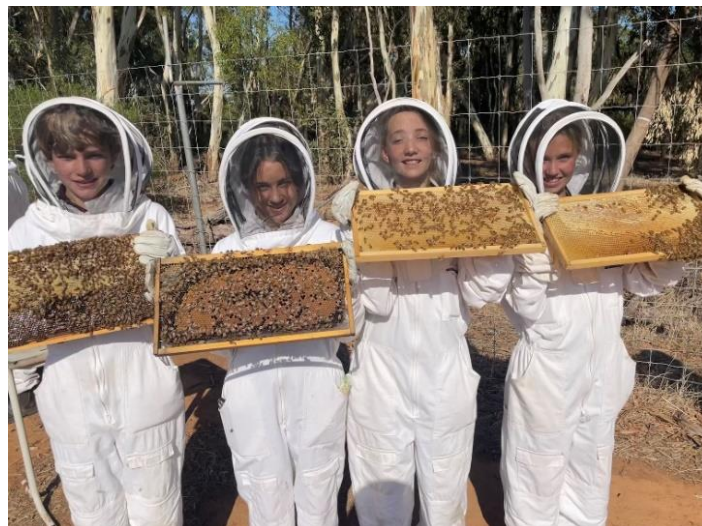
The bees' knees: Year 8 students on their first trip down to the hives.