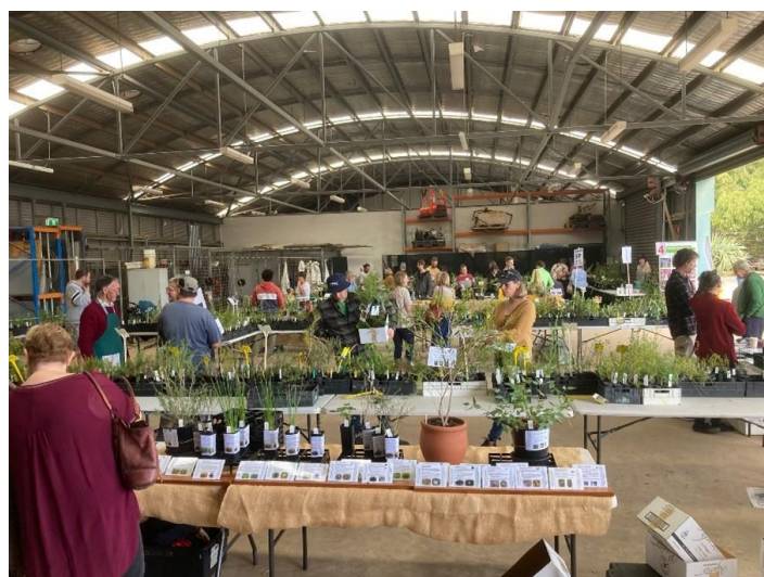
Native Plant Sale: Visitors to Urrbrae enjoying the range of native plants on offer.

In appreciation for the use of the facilities, the society generously donates proceeds of this event to support the Urrbrae horticultural program.