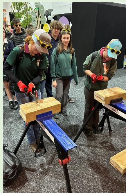
Construction Career Expo: Students at the CITB stand – hands on experience in construction.

information provided to them in upcoming information sessions at Assembly in Week 9 and 10 this term.