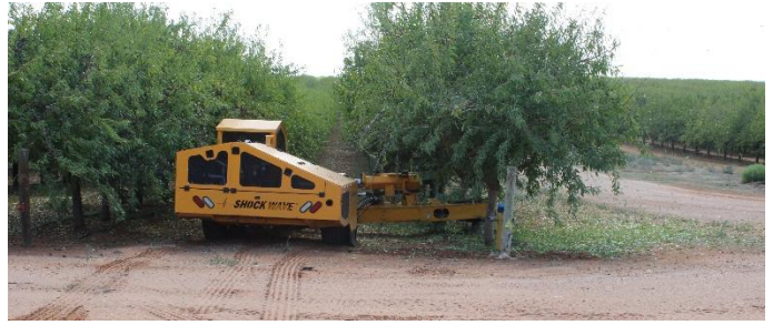
Shake it up: An almond tree shaker which helps the almonds fall to the ground so they can be collected for drying and processing