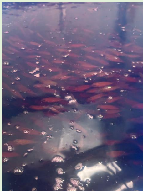
Figure 1: Purple dyeing of baby fish

Students witnessed mega sized snapper over 7-10 years old in huge tanks, baby fish swimming in purple water, having their otoliths (ear bones) dyed purple to mark them for release (figure 1), oysters, baby snapper being grown out (figure 2), algae grow rooms (figure 3), and interesting specimens under the microscope.