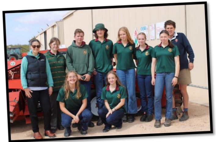
Above: Group Shot with the Almond picking machine and below: Checking Flood Levels at the Loxton Tree of Knowledge