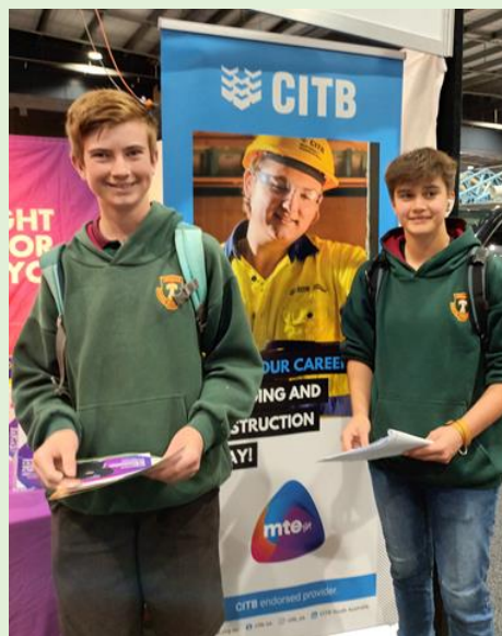
CITB Career Expo: Students at the Construction Industry Training Board (CITB) Hub at the Expo.

to implement a similar program to Urrbrae in his school in NSW.