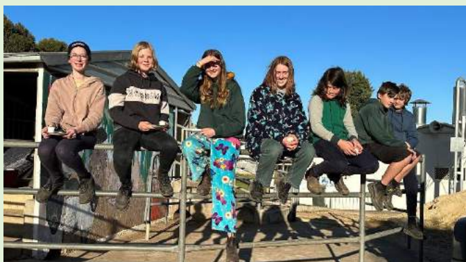
Sleep-over wake up