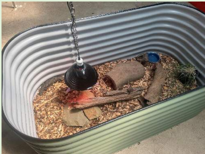
Our new lizard habitat

The sanctuary is a dynamic project with lots going on, and the last few months have certainly proved that to be true. For the first time in at least a decade we are displaying reptiles in the sanctuary. There have been some offers of reptile donations to the school and recently we took up a couple of the offers and built a lizard display using a raised garden bed as the basis for the habitat. We have two bearded dragons, a blue-tongue lizard and a pair of stumpy lizards who all take turns stretched out under a heat lamp.