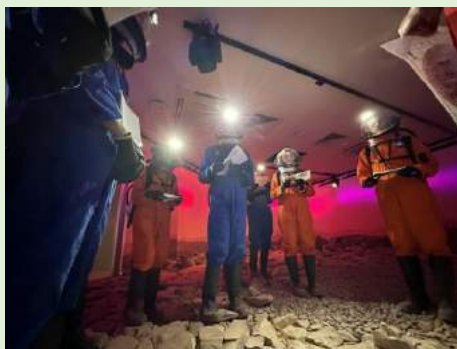
Undertaking martian ground work

Day Two was a tour of the Defence Science and Technology group. I was blown away by their modern laser systems and their radio telescopes.