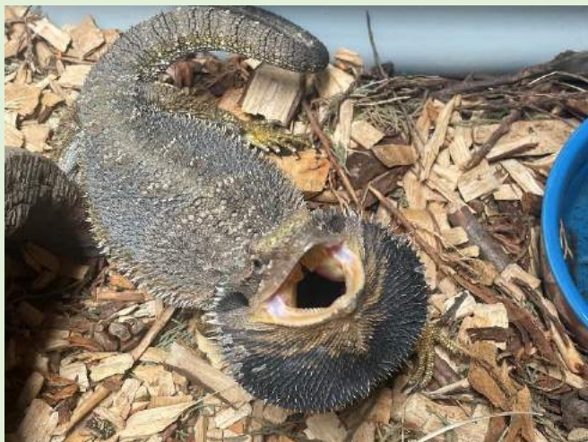
One of our new bearded dragons in display mode

They are certainly an entertaining addition to our collection and a great expansion in the experiences of animal care for our club members.