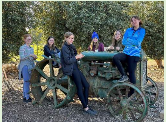
Sleep-over breakfast on a tractor