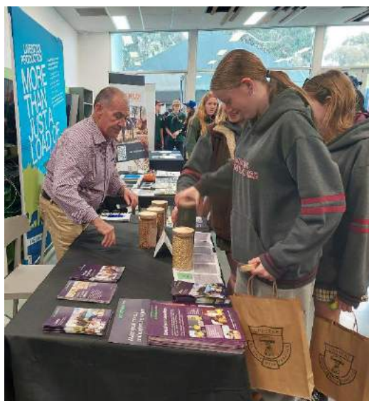
Students enjoyed exploring career choices at the Expo