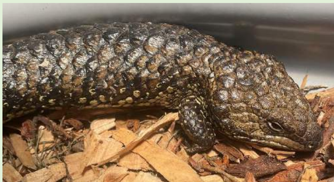
A sleepy lizard being sleepy

They are certainly an entertaining addition to our collection and a great expansion in the experiences of animal care for our club members.