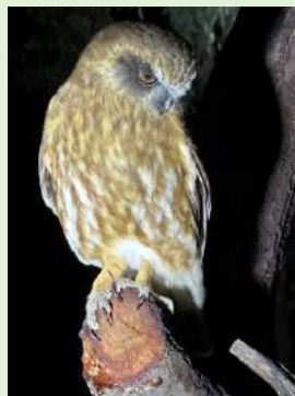
A wild boobook owl comes to visit

After a pizza dinner, we went out spotlighting around the school looking for interesting night-time inhabitants. As well as flying foxes, we saw boobook owl close up hunting for mice in the sanctuary, and less pleasingly, a fox out among the cattle in a paddock. Some students got some sleep, and then a bacon and eggs breakfast.