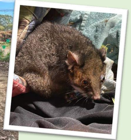
Above: "Blinky" the Ringtail Possum Right: Release the turtles!