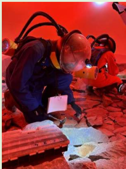
Martian surface operations

Working with surface operations, my role was the geologist, where I would collect rock samples and do tests on them. However, I was then allocated the position of Commander of Ground Control Operations!! Such power was put in my hands.