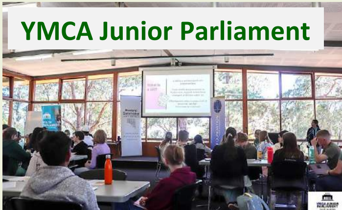
Day One – Nunyara Conference Centre

D uring the term 3 break, I was involved in the YMCA's Junior Parliamentary program. This was a 3-day residential camp, for students between the age of 12 to 15, with each day being a new and immersive way to learn about parliament and parliamentary processes.