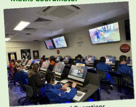
Martian Ground Operations

Day Four was my least favourite day, because it was the final day of the camp and I would have to say goodbye to my new friends. Very sad indeed.