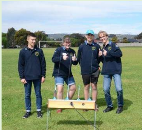
Launching model rockets!

Space Camp was absolutely out of this world! Four absolutely packed days of Aerospace fun. Day One was a tour of many of the complexes inside Lot 14 (the new Aerospace development), this included the BOM Space Weather Centre – which was absolutely stellar.