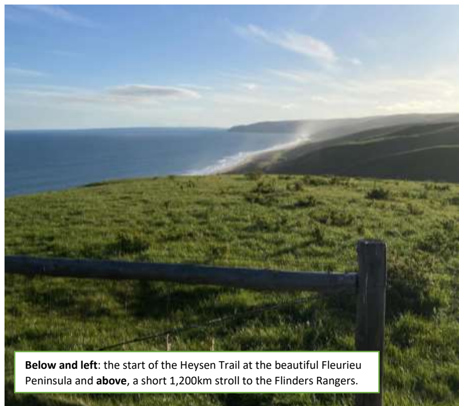
Below and left: the start of the Heysen Trail at the beautiful Fleurieu Peninsula and above, a short 1,200km stroll to the Flinders Ranges.