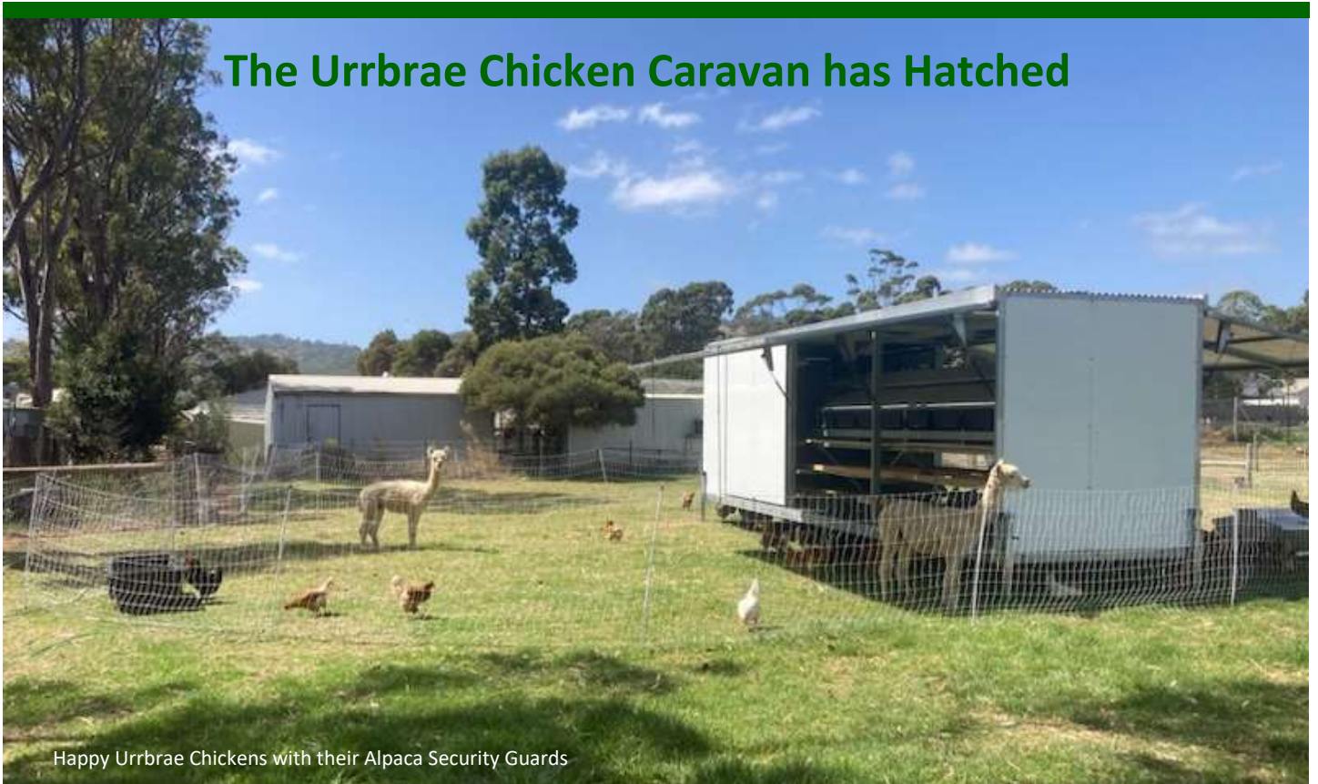
Happy Urrbrae Chickens with their Alpaca Security Guards

U rrbrae continually strives to adopt innovations in agriculture and horticulture practices to expose our students to new and emerging approaches to production techniques. The implementation of a Chicken Caravan is an excellent example of this. The caravan provides many benefits including: