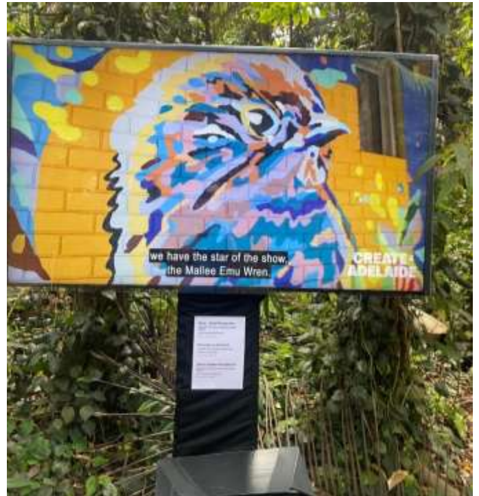
Above: The mural, exhibited in the conservatory at the Adelaide Botanic Gardens