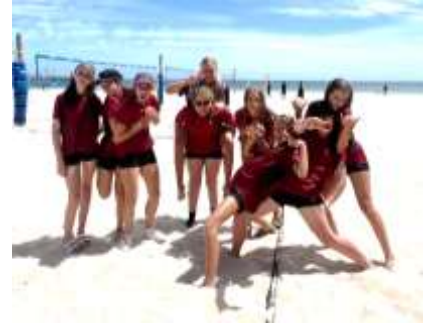
Beach Volleyball Team

Despite the varying levels of ability, our students have risen to the occasion, with notable victories in tennis, with our girls' team finishing top and boys' team placing second. Cricket, played in a super 8's format, saw our girls' team excel in their first day carnival experience, while the boys demonstrated their dedication and skill on the field.