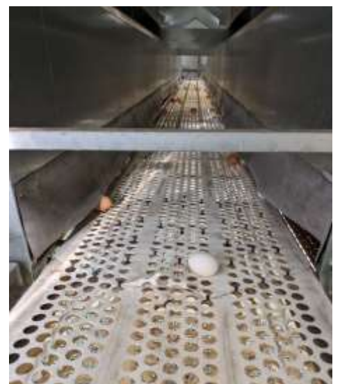
Above: Bird's eye view inside the Chicken Caravan