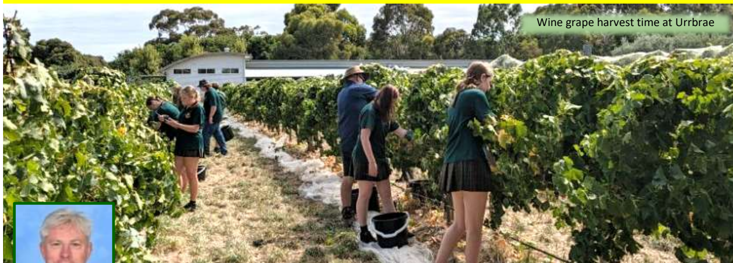
Wine grape harvest time at Urrbrae

URRBRAE AGRICULTURAL HIGH SCHOOL 505 Fullarton Road, Netherby 5062 Ph: (08) 8274 7455 Fax: (08) 8274 7499 Email: dl.0798.admin@schools.sa.edu.au http://www.urrbraehs.sa.edu.au